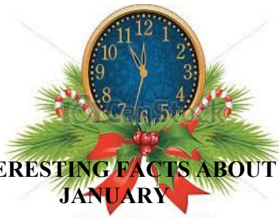
© Can Stock Photo - csp7798227